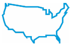
State Mandated Courses