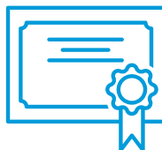
Certificates & Reporting